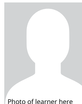
Photo of learner here

Should you not receive feedback from us in January, please regard your application as unsuccessful.